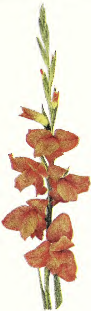
Orange Prince Vos